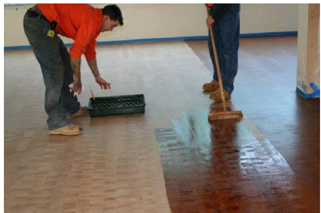
Applying Woca Oil using lambswool applicator

after each application. The oil is applied and re-applied until the blocks will not take on any more oil. After each oiling and wiping off excess, the floor MUST be buffed and re-buffed with absorbent towels or other soft cloth so that there is NO oil left on the surface. You cannot overbuff. Continue buffing until no oil is left behind.