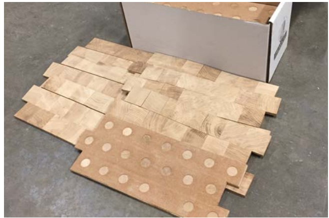
Acclimation of pavé panel blocks

We are often questioned about the humidity being too high or too low. Humidity maintained above 60-70% at normal residential temperatures can adversely affect wood components. Humidity sustained at or above this level can result in an EMC of 12% or more with associated expansion.