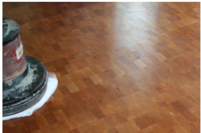
Application of Woca Oil